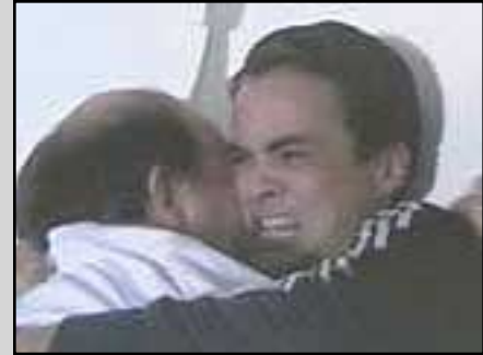
"My Husband's Son"